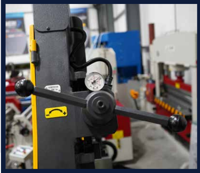
BLADE TENSION INDICATOR