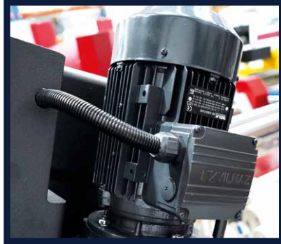
HEAVY DUTY MOTOR & GEARBOX