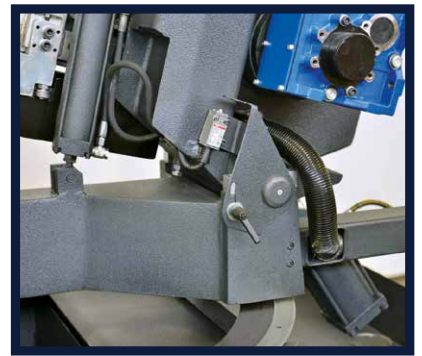
HEIGHT ADJUSTMENT SWITCH