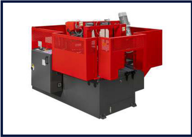
370 A DV Bandsaw with Guarding in Place