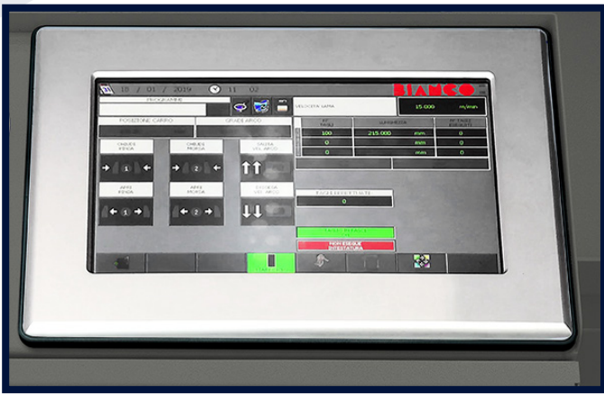
7" TOUCH SCREEN CONTROL PANEL (OPTIONAL 10" TOUCH SCREEN CONTROL PANEL)