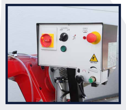
GRAVITY DOWNFEED CONTROLLER