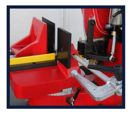
VICE & MATERIAL LENGTH STOP