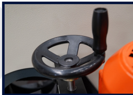
MANUAL PIPE CLAMPING