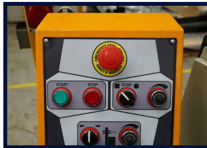
FOOT PEDAL CONTROL