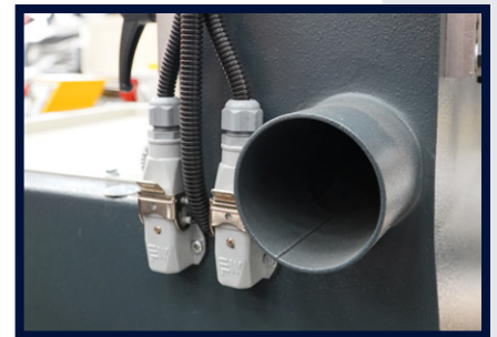
DUST EXTRACTION PORT