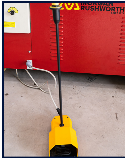
FOOT PEDAL CONTROLLER