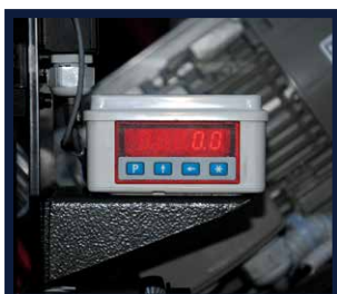
CUTTING ANGLE DISPLAY (OPTIONAL)