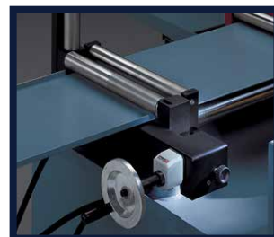
CUTTING LENGTH ADJUSTING WHEEL