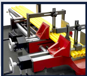
MECHANICAL BUNDLE CLAMPING DEVICE (OPTIONAL)