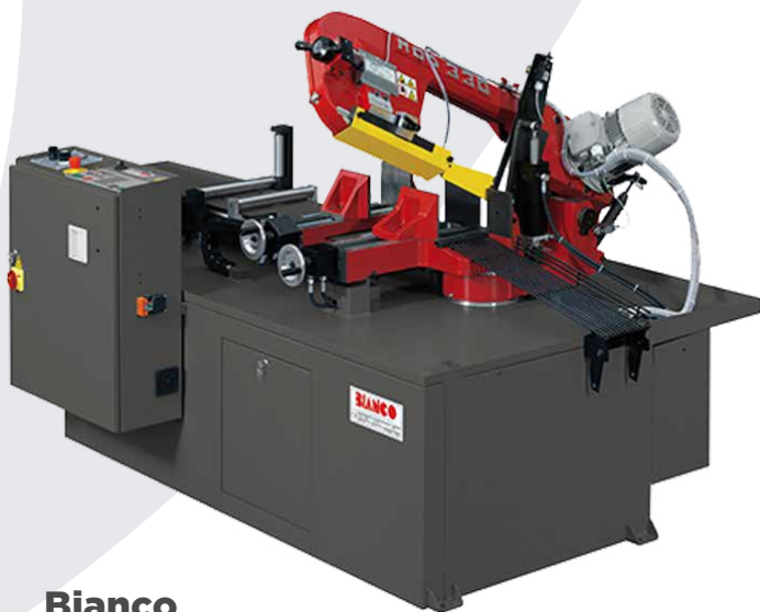
Bianco 330AE PLC (Guards Removed)

The Bianco 330AE Fully Automatic Single Mitre Bandsaws 415v are esteemed for their reliability, dependability and high accuracy which are hallmarks of Bianco Bandsaws.