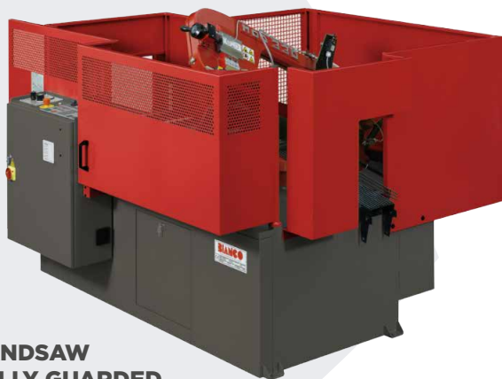
BANDSAW FULLY GUARDED