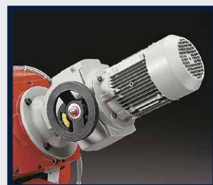
VARIABLE BLADE SPEED (10-100 M/MIN) (OPTIONAL)