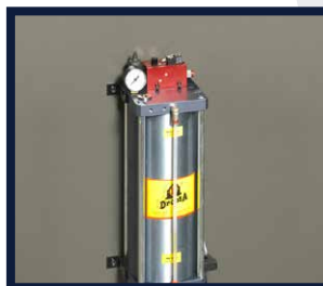
DRY COOLING DEVICE (OPTIONAL)