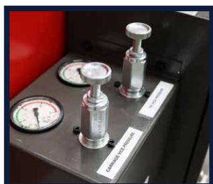
DOUBLE VICE PRESSURE REGULATOR (OPTIONAL)