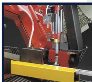
BLADE DEFLECTION CONTROL DEVICE (OPTIONAL)