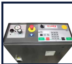
NC CONTROL PANEL