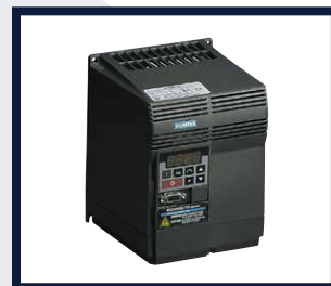
FREQUENCY CONVERTER (OPTIONAL)