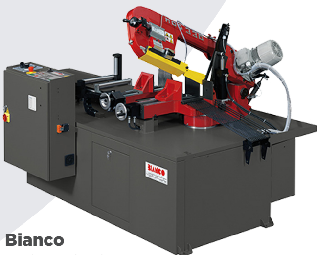
Bianco 330AE CNC (Guards Removed)

The Bianco 330AE CNC Single Mitre Bandsaws 415v are esteemed for their reliability, dependability and high accuracy which are hallmarks of Bianco Bandsaws.