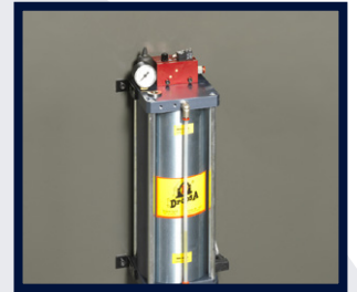
DRY COOLING DEVICE (OPTIONAL)