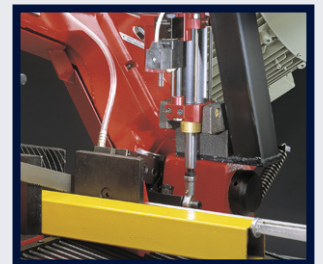
BLADE DEFLECTION CONTROL DEVICE (OPTIONAL)