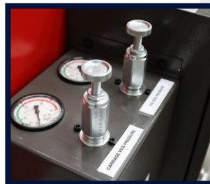
DOUBLE VICE PRESSURE REGULATOR (OPTIONAL)