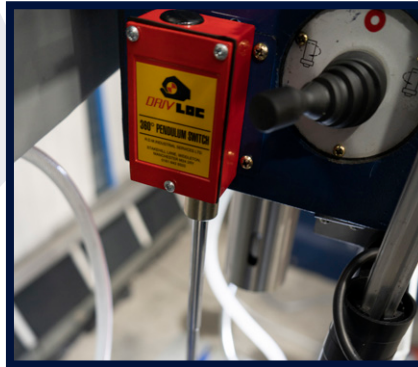
DC INJECTION BRAKE