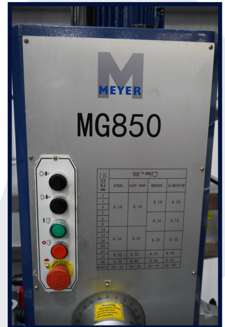
MG850 MAIN CONTROL PANEL