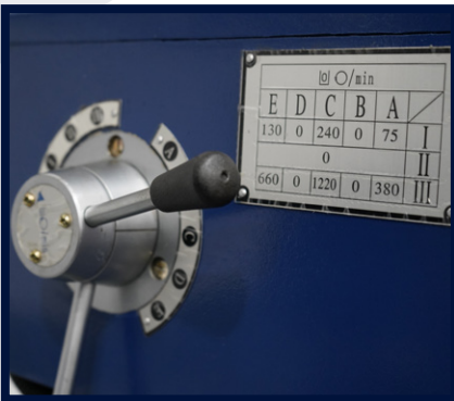
VARIABLE (STEPPED) GEARING