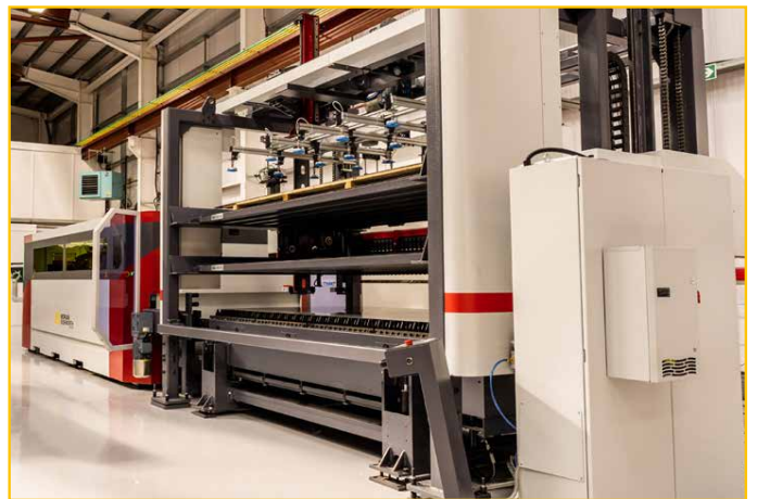
Optional Compact Stacker System