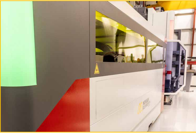
Safety Glass Vision Panels