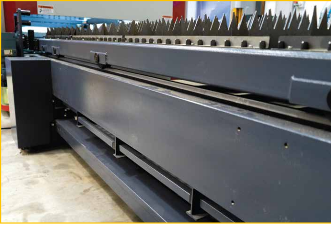
Dual Shuttle Exchange Tables