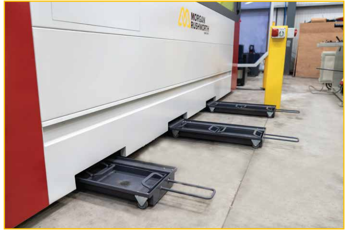
Removable Scrap Trays