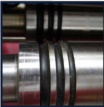
ROUND BAR GROOVES