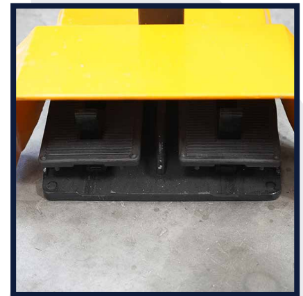
FOOT PEDAL CONTROLS