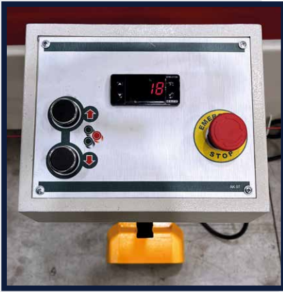
POWERED SIDE ROLL CONTROLLER WITH DIGITAL READOUT (OPTIONAL)