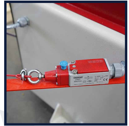
TRIPWIRE SAFETY SYSTEM