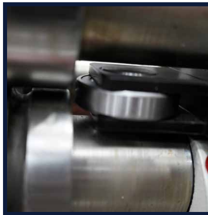
CONE ROLLING WHEEL