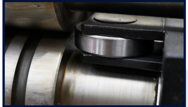
CONE ROLLING WHEEL