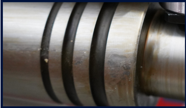
ROUND BAR GROOVES