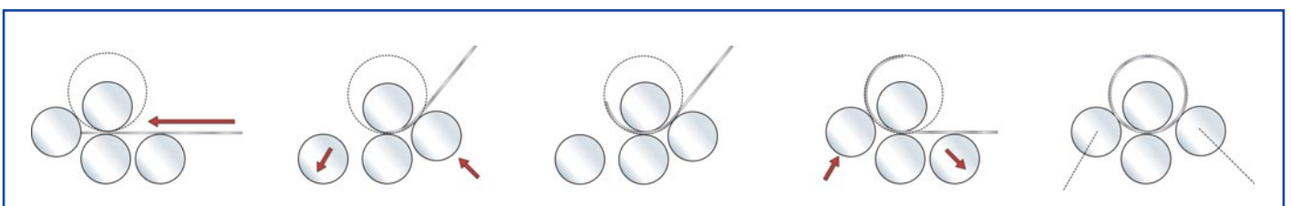
4-ROLL BENDING PROCESS