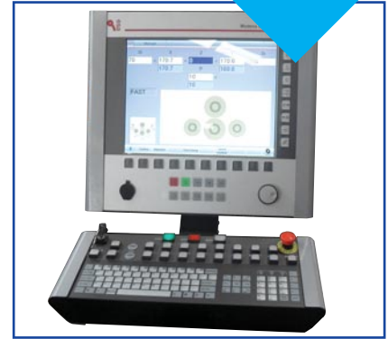
OPTIONAL CNC CONTROL PANEL