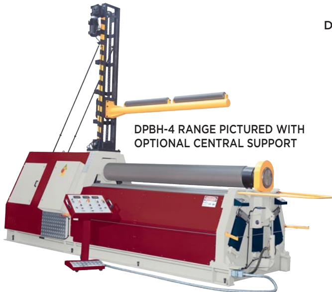
DPBH-4 RANGE PICTURED WITH OPTIONAL CENTRAL SUPPORT