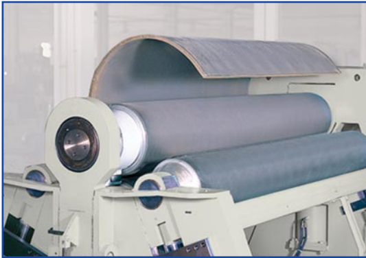
4 ROLL BENDING