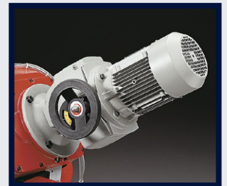
VARIABLE BLADE SPEED (10-100 M/MIN) (OPTIONAL)