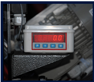
CUTTING ANGLE DISPLAY (OPTIONAL)