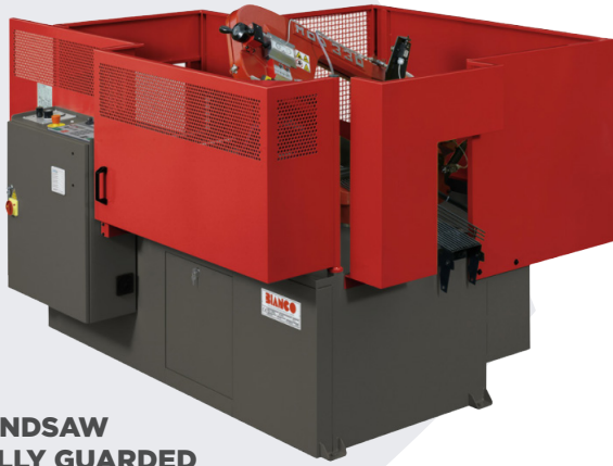
BANDSAW FULLY GUARDED