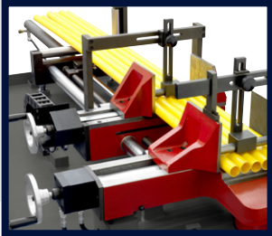
MECHANICAL BUNDLE CLAMPING DEVICE (OPTIONAL)