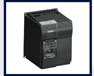
FREQUENCY CONVERTER (OPTIONAL)