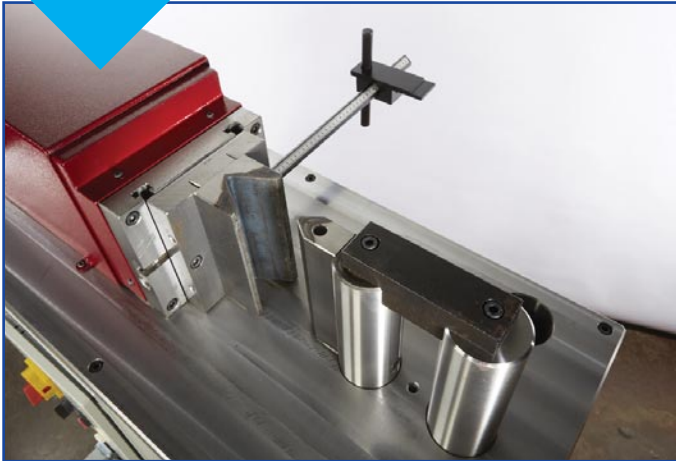
MEASURED RULE STOP