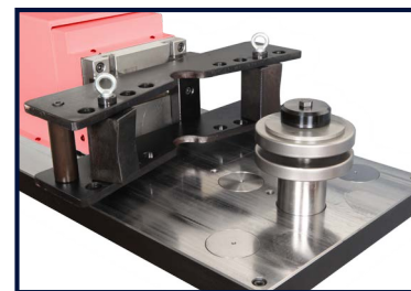
FLAT BAR BENDING