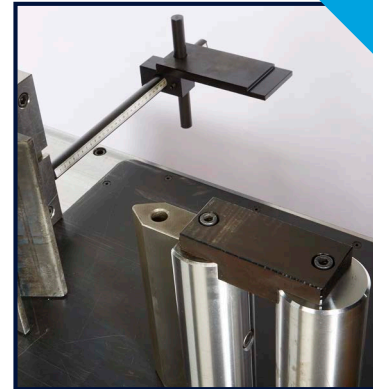
MEASURED RULE STOP