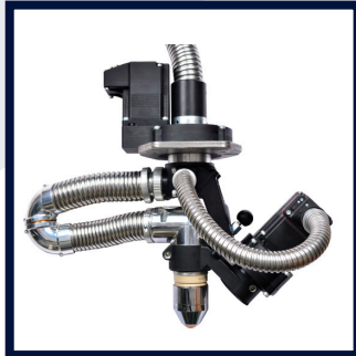
BEVEL CUTTING SYSTEM