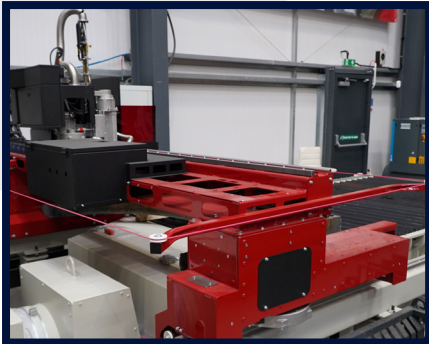
WIDE GANTRY PROVIDES CUTTING STABILITY

Alternatively, existing extraction systems can be used.