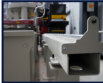
INDEPENDENT GANTRY RAILS

Ajan Electronics produces all machine parts in its own factories; the plasma generator, CNC unit, cutting torch, consumables, servo motors, moving parts, all electronic parts and steel structure which means we can source any replacement parts you might need quickly and easily, reducing downtime.