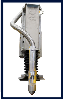
STRAIGHT CUT TORCH

An optional manual bevel cutting adapter is available.