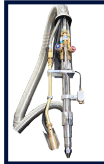
OXY FUEL TORCH

"We can get bigger sheets on there, and as a result there are fewer offcuts, therefore reducing our costs. It is much faster and our clearing up time is much reduced compared to the old one - with the Ajan there is very little cleaning required. It has a bigger capacity, so we can fulfil more of our customer needs, do extra jobs above what we had the capability to do before."