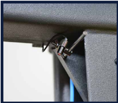
LASER CUTTING LINE (OPTIONAL)