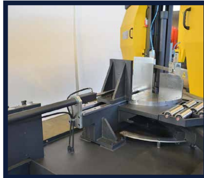
HYDRUALIC CLAMPING ANGLE