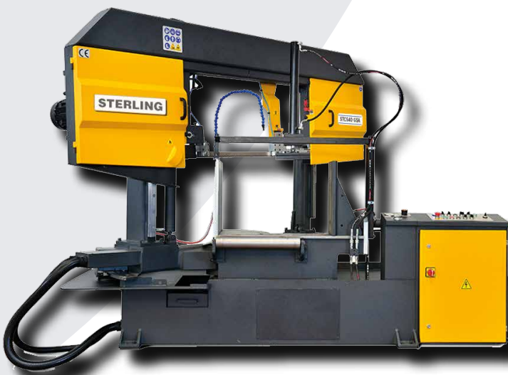
STC 540 GSA

The Sterling STC GSA twin column, semi automatic, single mitre bandsaw range comes in a variety of capacities. These twin column saws, mitre head saws offer strong rigidity, for accurate cutting of large material.