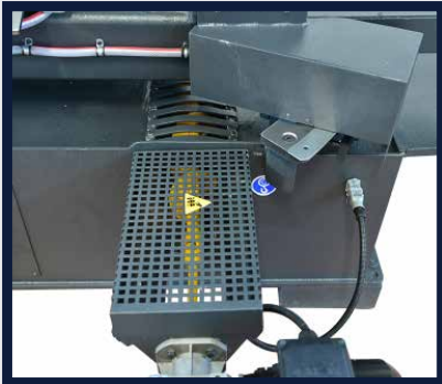
CHIP CONVEYOR (OPTIONAL)