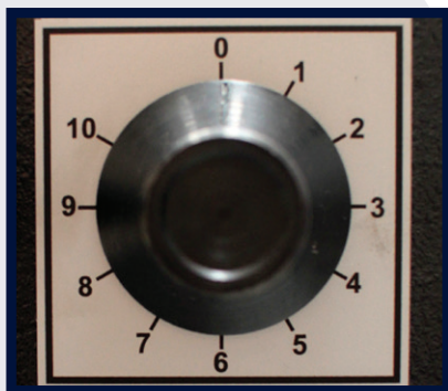
CUTTING FEED ADJUSTMENT