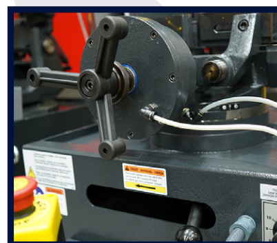
PNEUMATIC CLAMPING VICE