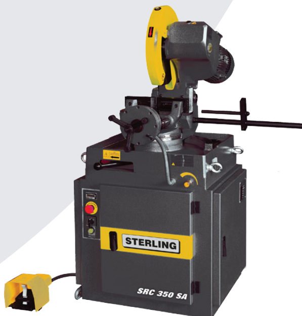
Sterling SRC350 SA

The robust construction and quality finish of the Sterling SR range of semi-automatic circular sawing machines is unrivalled. The SRC range has the ability to safely and quickly cut through a multitude of materials. The material slitting feature paired with the double clamping and self centring vices guarantees the material is always securely clamped in the optimum cutting position. Models with 275, 315 and 350mm diameter blades are offered as a fast cutting semi-automatic design, with pneumatic clamping for production cutting. The eccentric vice of the SRE allows for specific applications that would otherwise be impossible on the centred vice.