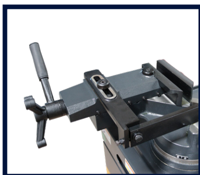
ECCENTRIC VICE (SRE RANGE)