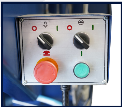
LIGHTS & COOLANT