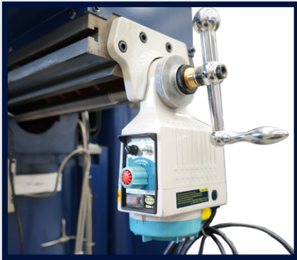
POWER FEED UNIT