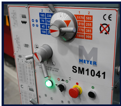
MAIN CONTROL BOARD