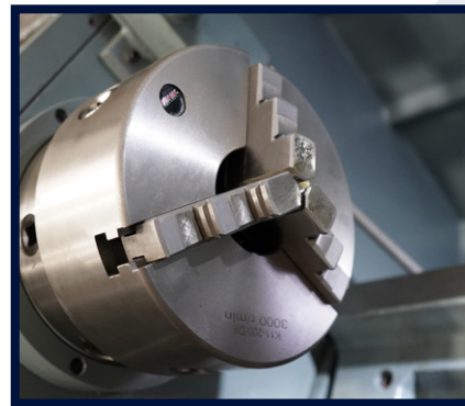
3 JAW CHUCK