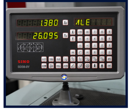
2 AXIS DIGITAL READ OUT