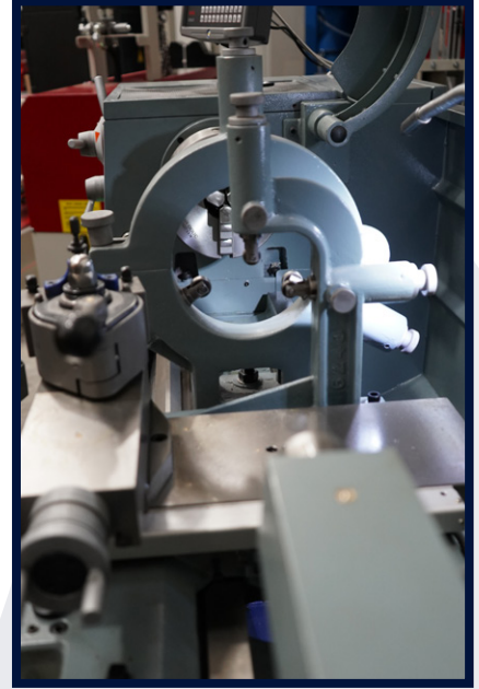
VIEW THROUGH THE BED AND SADDLE - SM RANGE