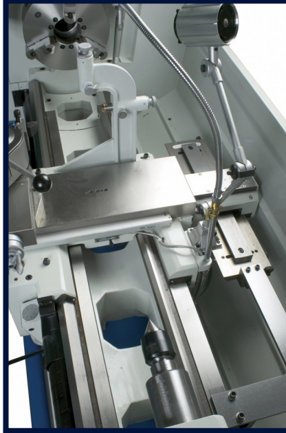
TAPER TURNING ATTACHMENT (OPTIONAL)