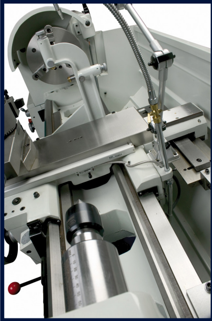
VIEW THROUGH BED AND SADDLE - SG RANGE