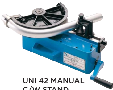
UNI 42 MANUAL C/W STAND