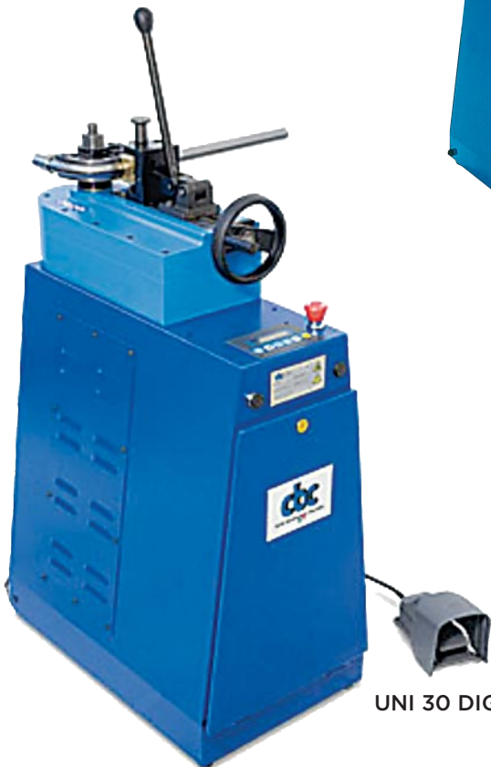
UNI 30 DIGITAL