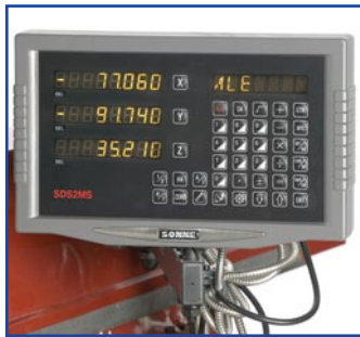
DIGITAL READ OUT