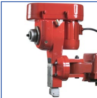
OPTIONAL SLOTTING HEAD