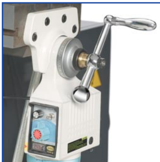
POWER FEED UNIT